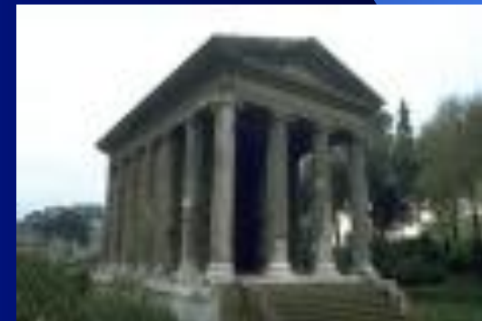
Temple of Fortuna Virilis