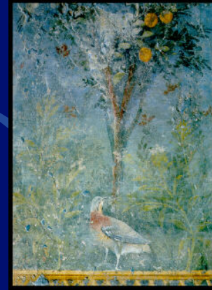
Bird in the Garden - Fresco