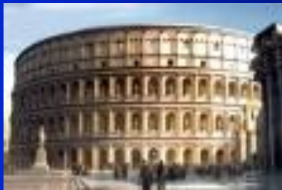
Coliseum – Arena