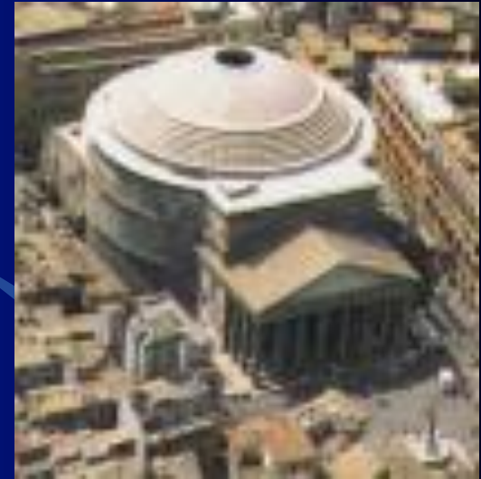
Rome Pantheon - Dome