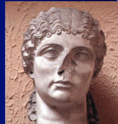
Roman Bust in marble